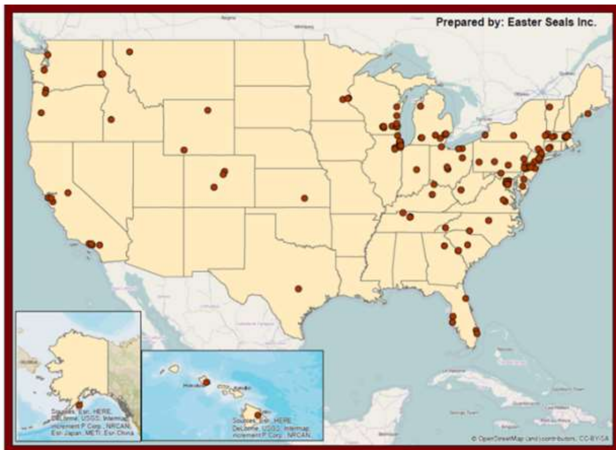
Figure 2: Online Dialogue Participants by Location

From a geographic perspective, participants represented 35 of the 50 states. Figure 2 illustrates the online dialogue participants' distribution across the states. Forty-three percent of the participants indicated that they live in suburban area, 36% lived in urban and 18% lived in rural areas. The reminder of the participants (3%) did not specify their location.